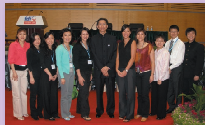
Photo taken at Dr William Cheung's lecture during the FDI World Dental Congress in Shenzhen, China. (September 2006) 攝於2006年9月中國深圳世界牙科聯盟年會張偉民醫生之講座